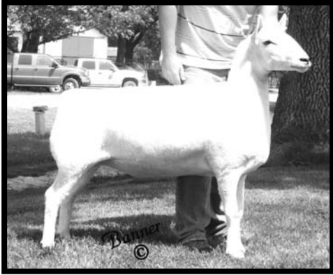
Champion Ewe at 2010 National Sale from Rincker-Woods Cheviots, IL selling to Misty Acres, PA

MOENTER HOMESTEAD 4721 Devil's Hole Rd. Pemberville, OH 43450 (419) 261-9555