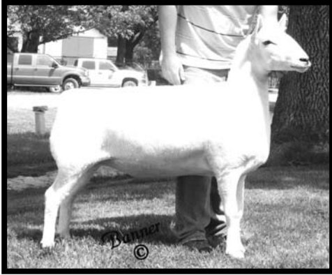
Champion Ewe at 2010 National Sale from Rincker-Woods Cheviots, IL selling to Misty Acres, PA

MOENTER HOMESTEAD 4721 Devil's Hole Rd. Pemberville, OH 43450 (419) 261-9555