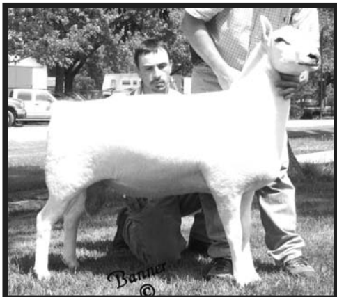
Champion Ram at 2010 National Sale from Triple J Acres, PA selling to Glasshoff Cheviots, NE

My lambs were late this year but I will bring two lambs that will be really good. Take a look and see if they are the piece you need in your flock. Sire might be "HJ", "1719" or "New Design"