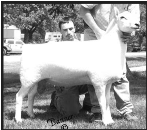
Champion Ram at 2010 National Sale from Triple J Acres, PA selling to Glasshoff Cheviots, NE

My lambs were late this year but I will bring two lambs that will be really good. Take a look and see if they are the piece you need in your flock. Sire might be "HJ", "1719" or "New Design"